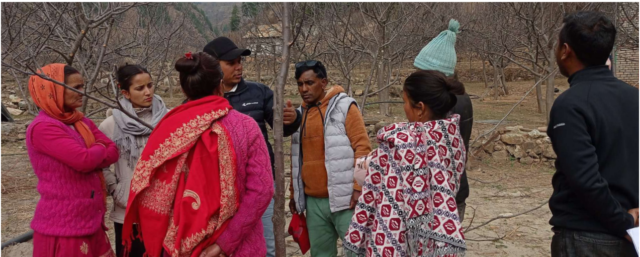
3 days commercial Fuji and Gala varietal apple farming training