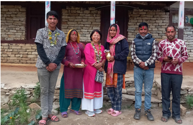
Apple Garden Homestay visit, Kanakasundari, Jumla.