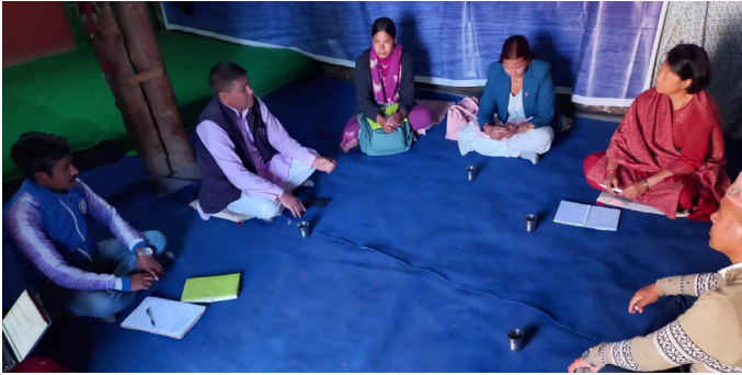
Meeting with Kanakasundari Rural Municipality Chair, Vice Chair and Section Officers.