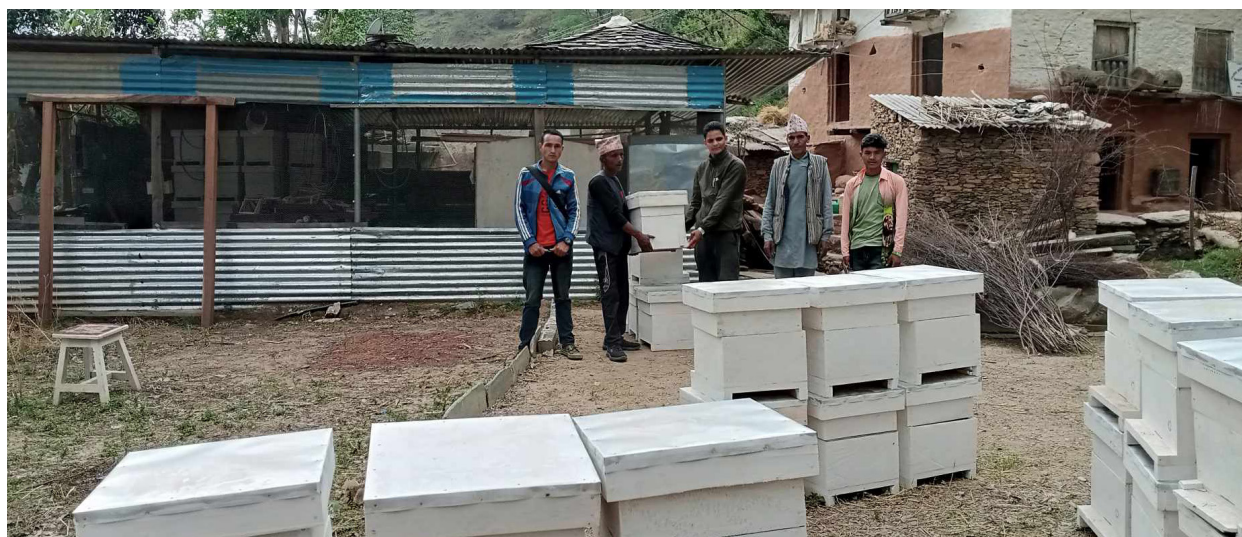
Modern beehives were handed over to beekeepers in Thalara, Bajhang, with 50% of the cost subsidized by the project and government.