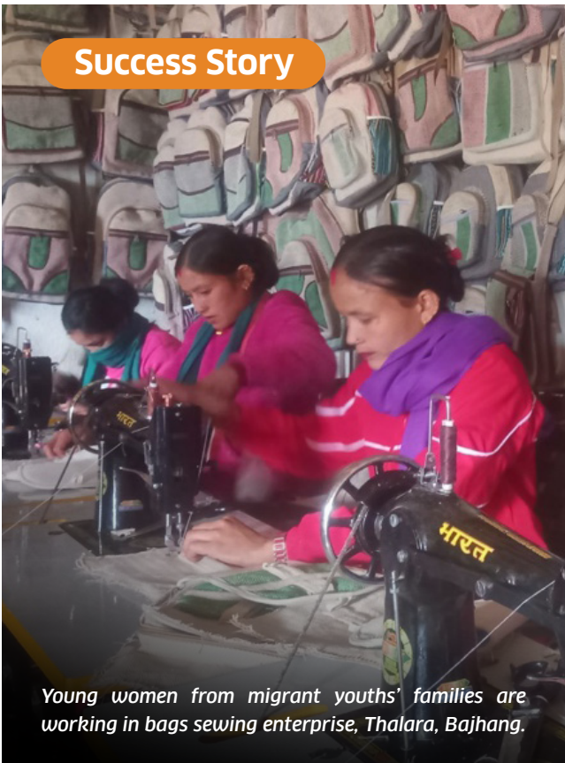
Young women from migrant youths' families are working in bags sewing enterprise, Thalara, Bajhang.

The bag sewing enterprise in Thalara, which uses the fibres of Himalayan nettle (sisno), is gaining remarkable recognition. Nine women produce and sell 231 bags, generating NPR 195,400 in revenue. This income will be reinvested into purchasing raw materials and training new participants, demonstrating the project's sustainable impact on local communities.